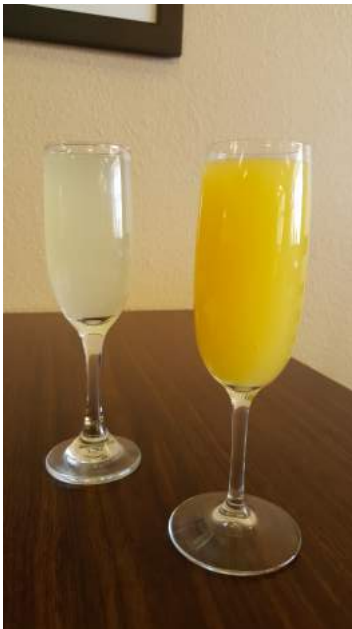
Mimosas, limosas and more!