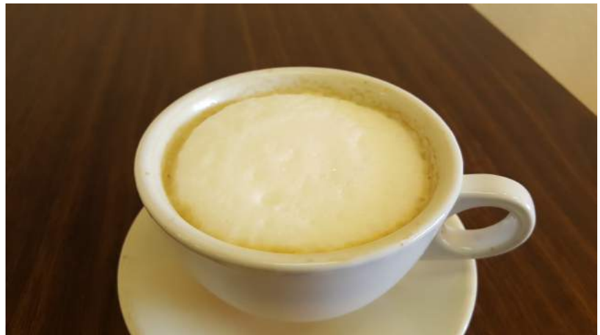
Cappuccinos, espressos, lattes, also great with Kahlua or Baileys