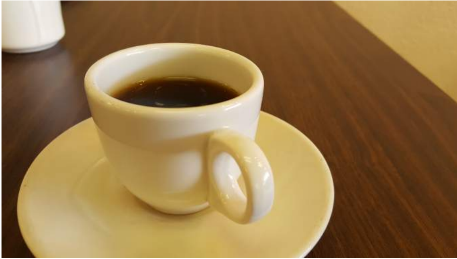
Coffee – add a shot of Kahlua or Baileys for a little extra pick-me-up